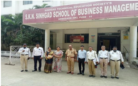
(RTO Team with Faculty Members)